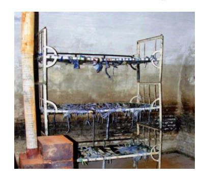
Prison cell with bunkbeds with no mattress, prisoners were obliged to sleep on. Stove for show only, never heated in cold winters.