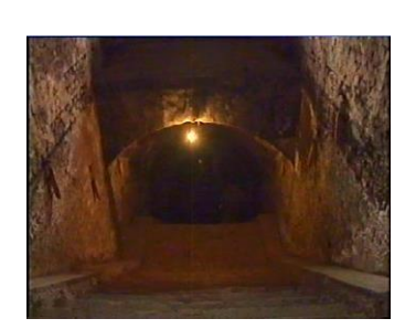
The Communist Jilava Prison. Entrance to the underground cells.